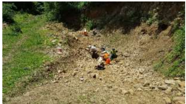
National Limestone Quarry #2 The wavellite pit