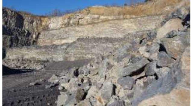
Teeters quarry, Gettysburg, PA view from bottom