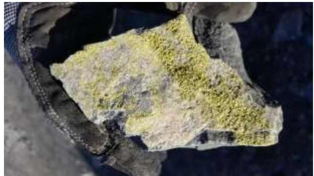
Teeters Quarry Gettysburg, PA Nice epidote crystals

Medford Quarry New Windsor, MD: Three days later we were in the Medford Quarry on 1111 Medford Rd., New Windsor, MD. This quarry, currently known as the Redland Genstar Quarry, Mindat lists only 7 mineral species for this site but it is a favorite place for easy collecting of Calcite crystals. Moreover, the calcite from here gives a very nice pink-orange fluorescence under short wave UV. The calcite from here forms both pointed and squat scalenohedral crystals and some collectors have found huge boulder-sized clusters of crystals to grace their yards or front steps.