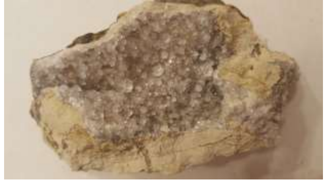
National Limestone Quarry #1, Middleburg, PA Nice calcite crystals and lots of it