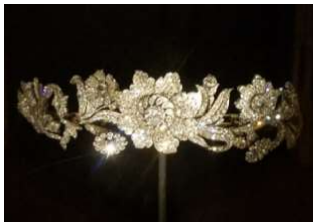
Tiara in GGM Gallery