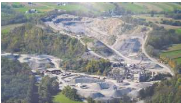
National Limestone Quarry #1, Middleburg, PA

I Also found a few good cacoxenite and strengite specimens, but these consisted of such tiny little balls that only dedicated micromounters would be content to search and find. Although the large green wavellite balls are a nice find, the tiny divergent sprays of clear, bladed wavellite crystals are quite beautiful under 20X magnification.