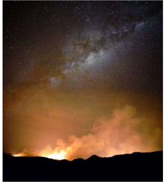
In a scene out of heaven and hell, wildfires light up the skies with the Milky Way.