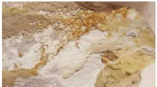
Planerite from the wavellite pit