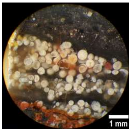
Impact spherules 32x optical microscope image from 3.47 billion-year-old rocks in Australia