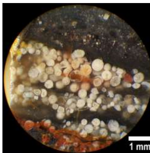
32x optical microscope image of impact spherules from 3.47-billion years ago in rocks in Australia.