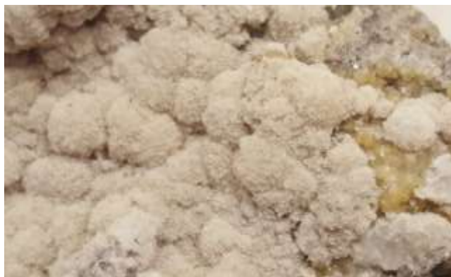
National Limestone Quarry #2 thick strontianite over calcite

Next month I will continue to share my mineral collecting stories at the following collecting sites: