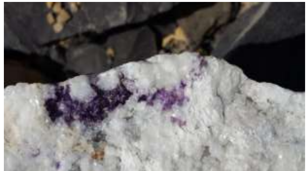
National Limestone Quarry #1, Middleburg, PA Fluorite in calcite