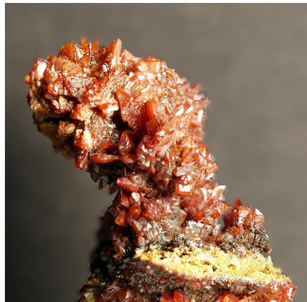
Descloizite from Berg Aukas Mine, Namibia. Field of view 20 mm.

The picture below is a new digital photo of the entire specimen. This photo is less artistic, and more like a mug shot. I do not know the identity of the yellow stuff at the base.