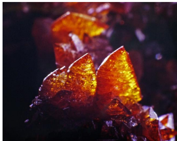
Descloizite from Berg Aukas Mine, Namibia. Field of view 8 mm.

The first photograph below I took about 35 years ago with a Minolta camera, bellows, and Kodachrome slide film. I was going for the dramatic backlighting effect. The orange and red shine out. A real mineralogist might think the effect is overdone, but I was younger then, and I since I am still not a real mineralogist, I still like it. When I bought this specimen, the label said it was from Tsumeb, Namibia, but I think that location is unlikely, because Descloizite is rare at Tsumeb, and crystals this large and this light in color are not typical of Tsumeb. I believe the true location is the classic Descloizite location of Berg Aukas Mine, Grootfontein district, Otjozondjupa region, Namibia, which is about 60 km southeast from Tsumeb.